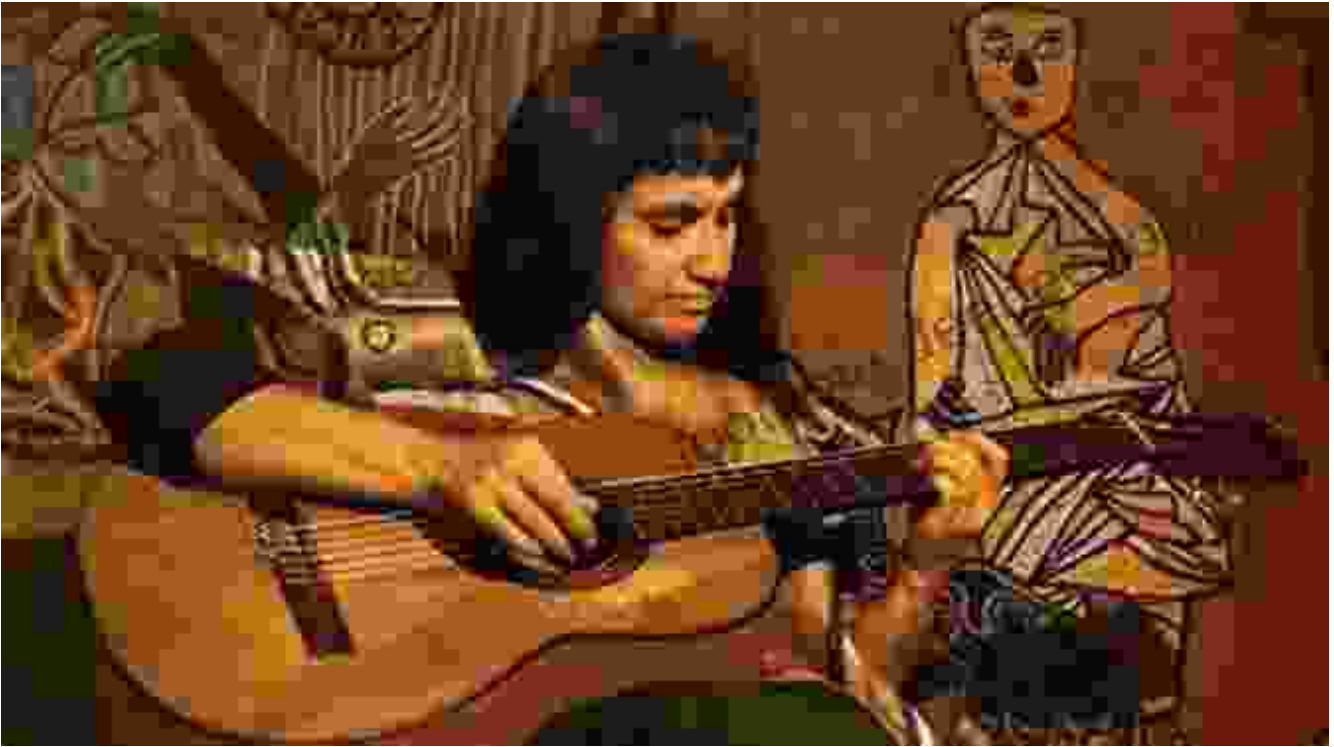
Violeta Parra, a master of the guitar

for her music and to connect with other artists who shared her passion for Chilean folk.