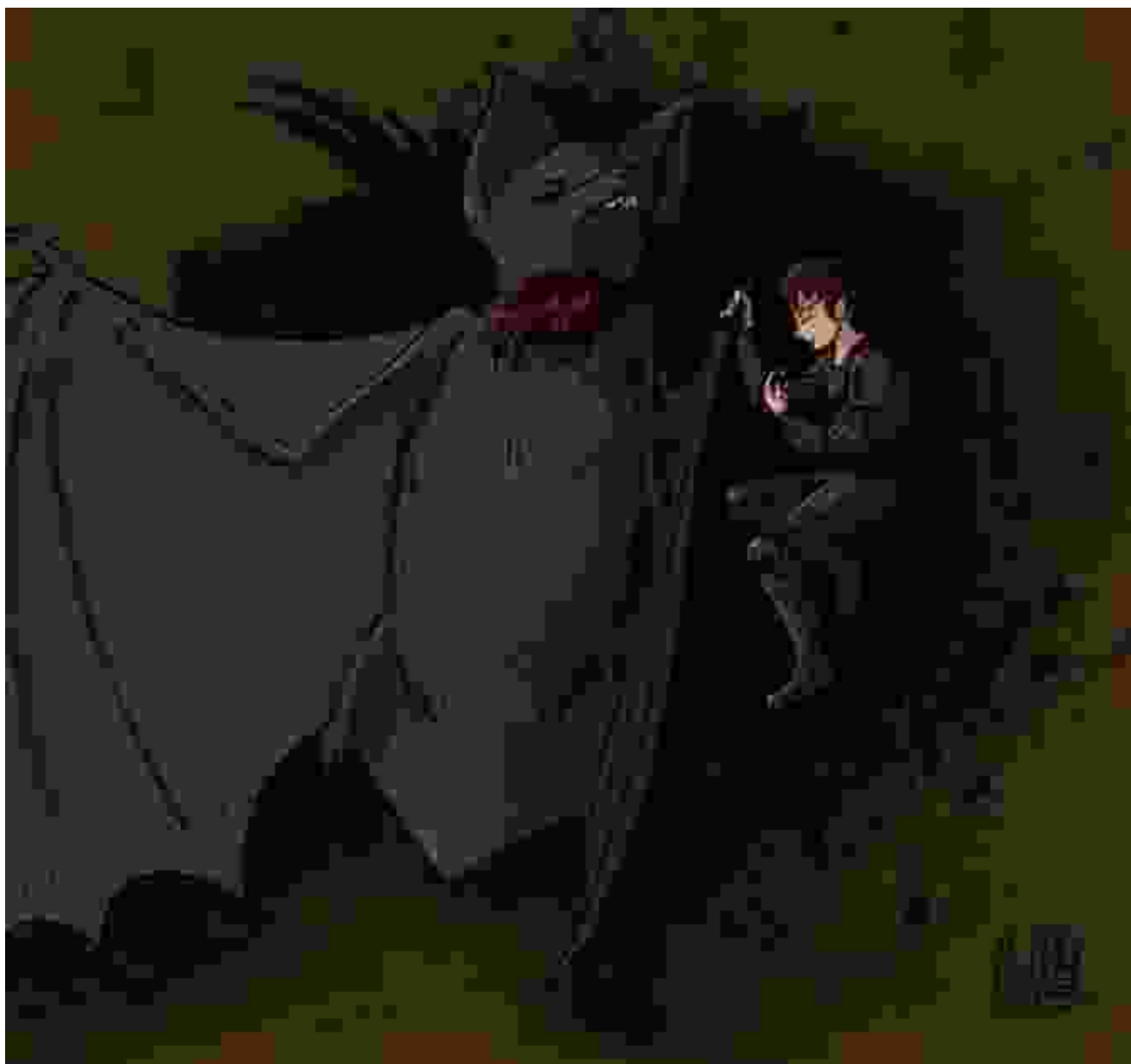
Gregor, the Swordsman

Gregor is a loyal friend and a fierce protector of those he cares about. He is also a bit of a hothead, but he always has his friends' backs.